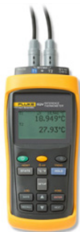
Figure 1 Example of a reference thermometer